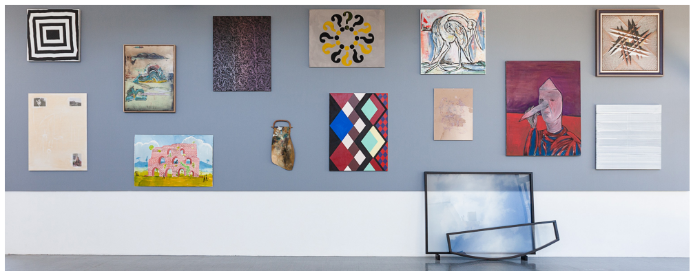
Paris Peinture, exhibition view, Le Quadrilatère, Beauvais, 2018.