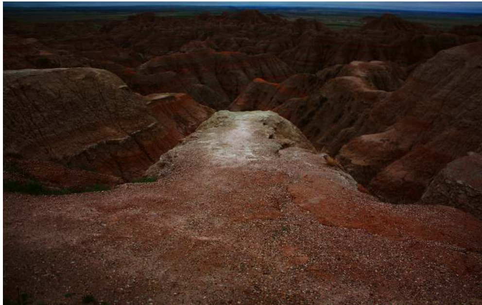
Cécile Hartmann The Black Snake #3

“Will come a black snake who will captivate men and devour the earth” Black Eagle prophecy, around 1930.